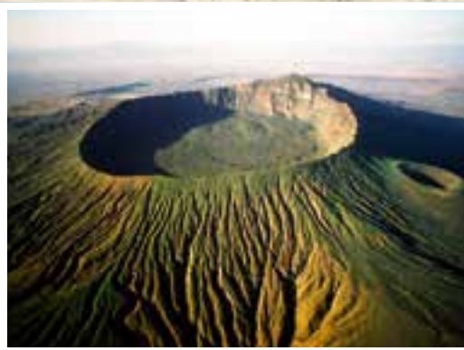
Menengai Crater Less than 1hr drive