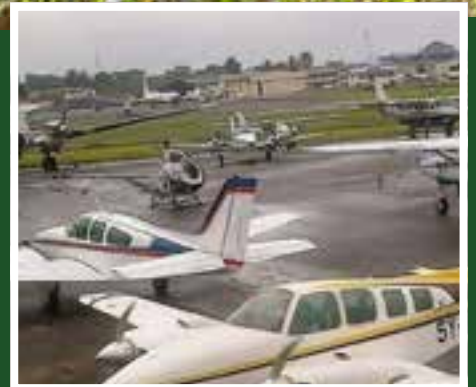
Upcoming Nakuru (Lanet) International Airport Less than 1hr drive