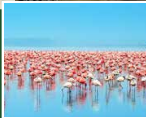
Lake Nakuru Less than 1hr drive